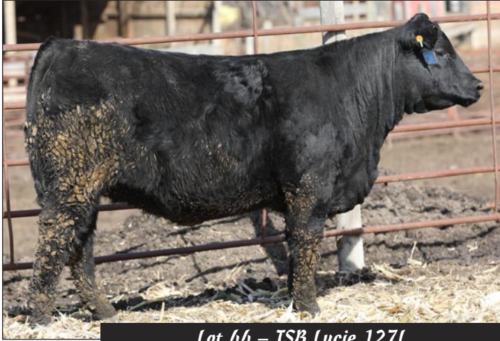
Lot 44 – TSB Lucie 127L