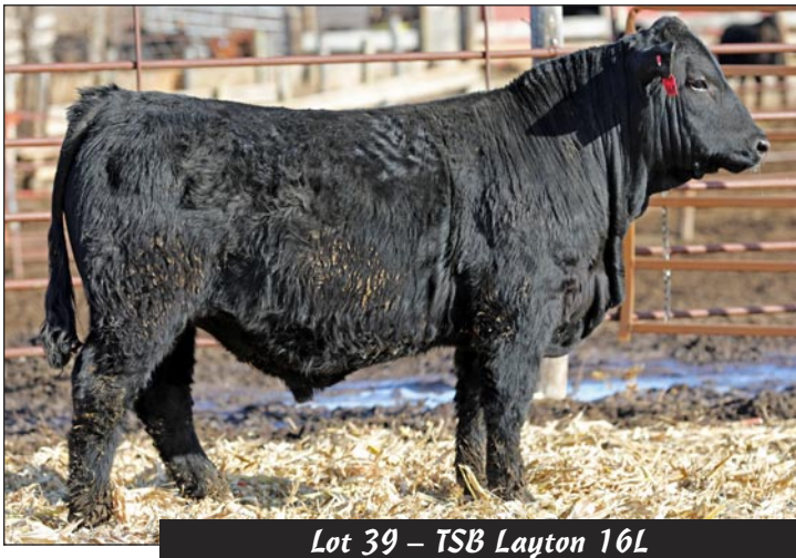
Lot 39 – TSB Layton 16L