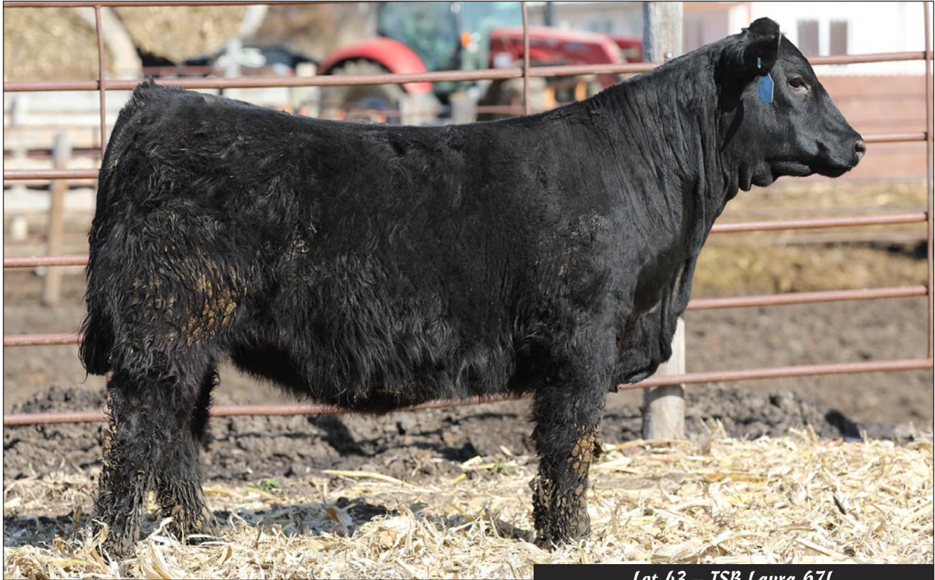
Lot 43 – TSB Laura 67L