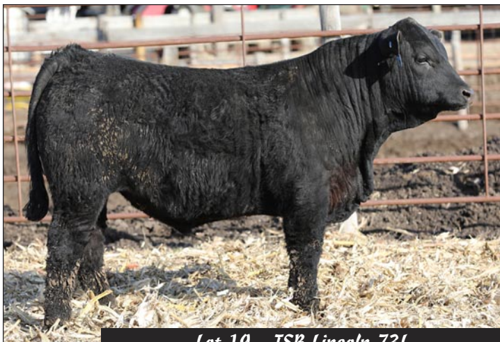
Lot 19 – TSB Lincoln 73L