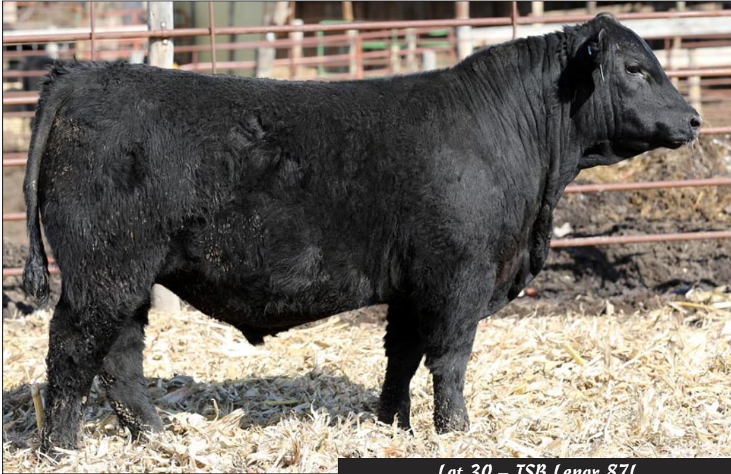
Lot 30 – TSB Lenox 87L