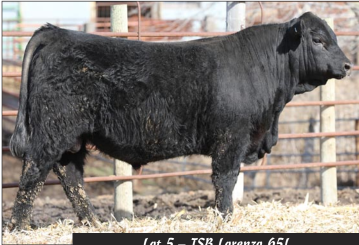
Lot 5 – TSB Lorenzo 65L