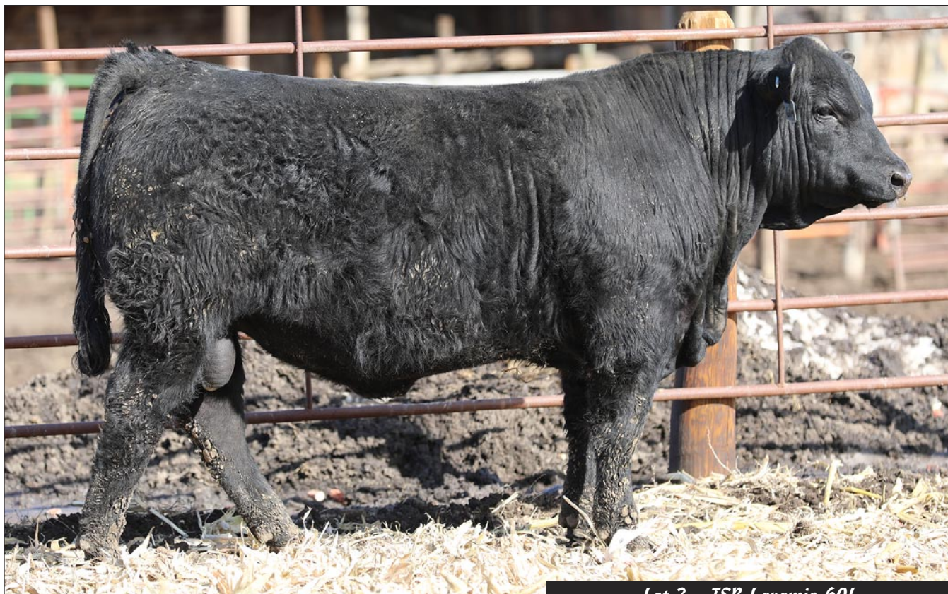
Lot 3 – TSB Laramie 60L