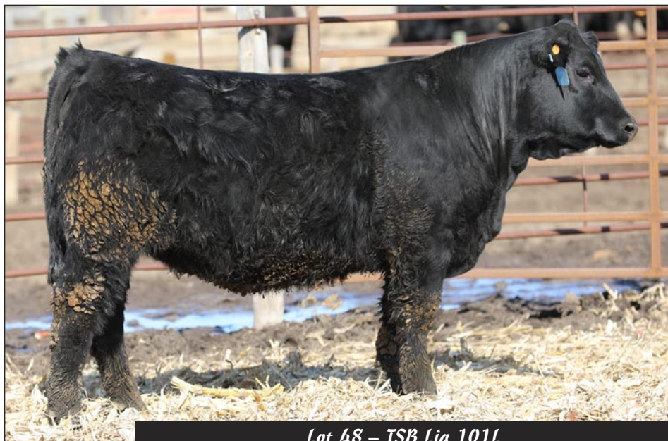
Lot 48 – TSB Lia 101L