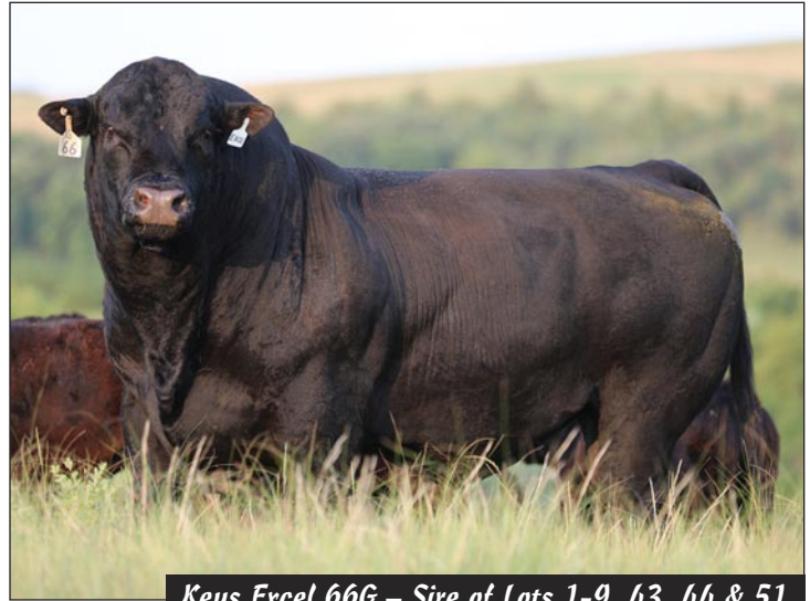
Keys Excel 66G – Sire of Lots 1-9, 43, 44 & 51