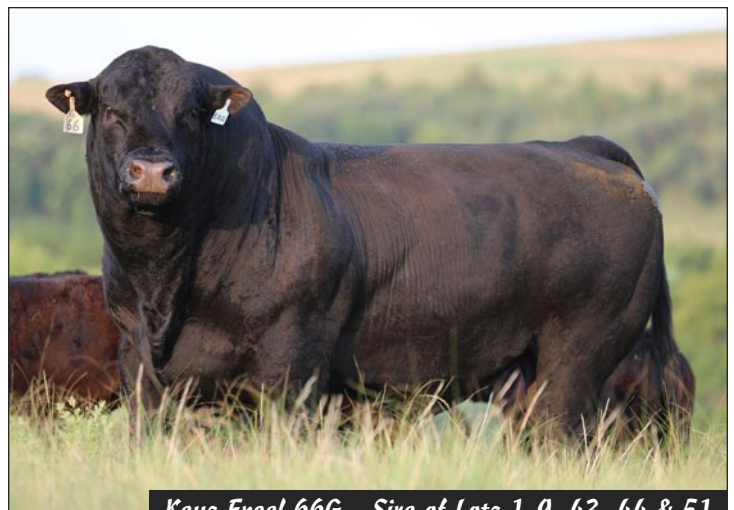
Keys Excel 66G – Sire of Lots 1-9, 43, 44 & 51

These heifers can fit into any program, whether it be seedstock or commercially based. We would absolutely love to keep all of these heifers in our own herd. They are the top 10 heifers out of the 92 contemporaries in the 2023 heifer crop. Several need to see the tan bark. Go to DV auctions and look at the individual videos of this top ten offering.