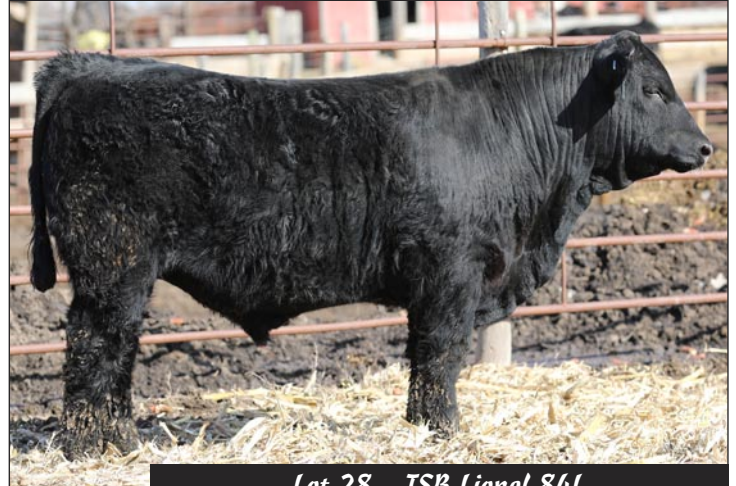
Lot 28 – TSB Lionel 84L