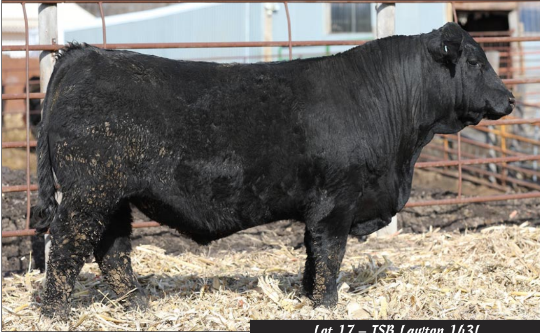
Lot 17 – TSB Lawton 143L

“Using Salers and Salers Optimizer bulls on your British cow herd is the road to profitability for both the cowman and the feeder.”