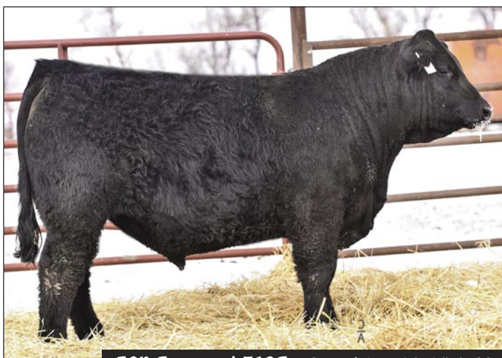
ECR Eastwood 713E – Sire of Lots 23-29 & 48