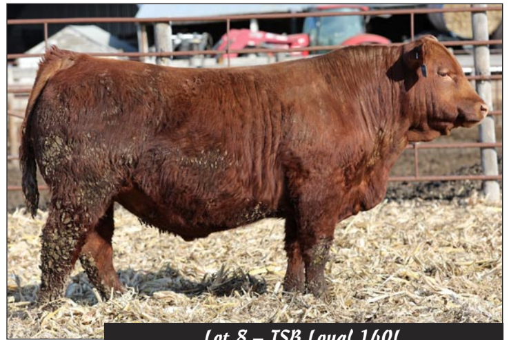
Lot 8 – TSB Loyal 140L