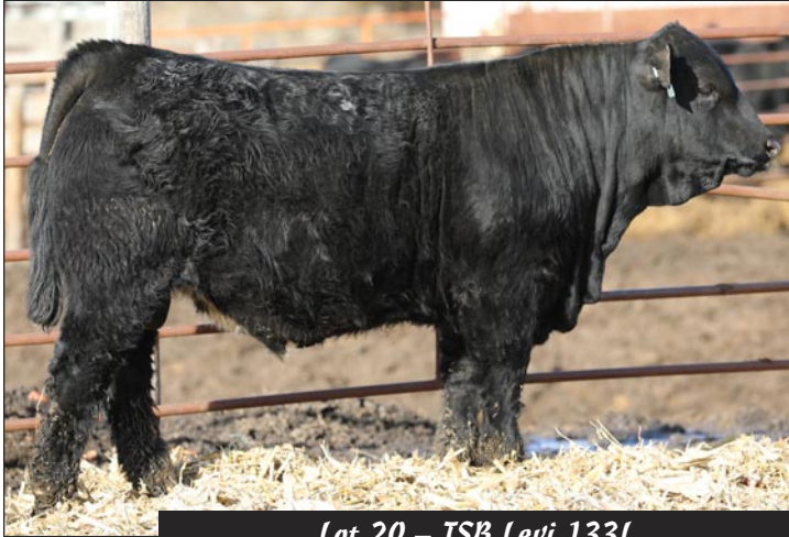
Lot 20 – TSB Levi 133L