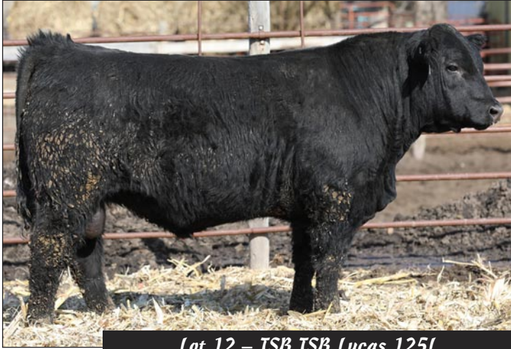
Lot 12 – TSB TSB Lucas 125L