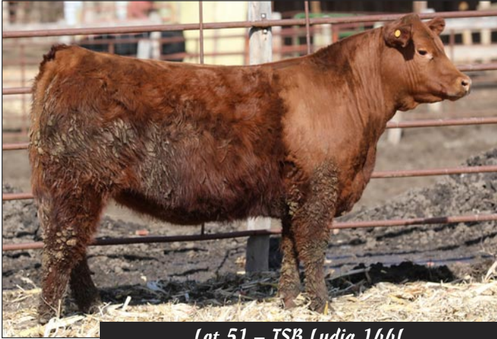
Lot 51 – TSB Lydia 144L