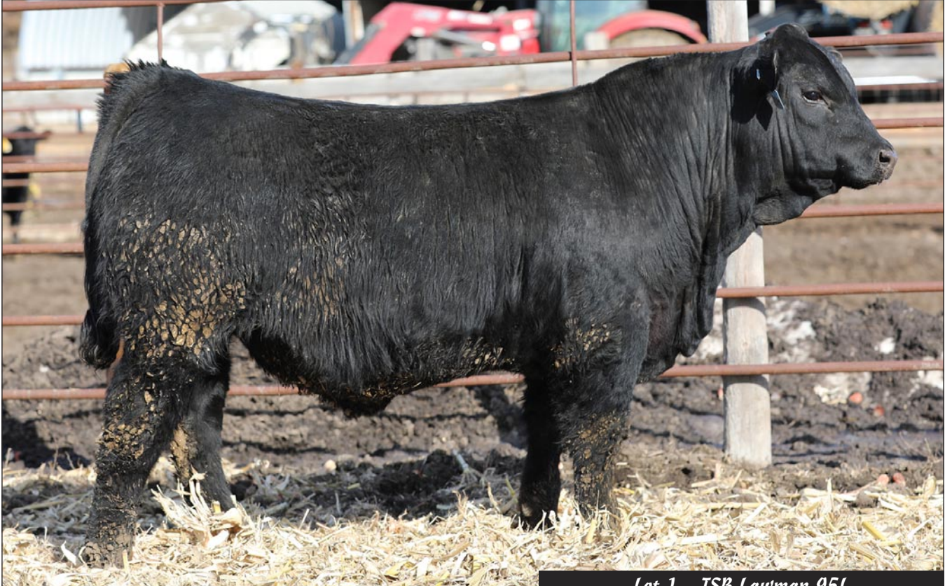
Lot 1 – TSB Lawman 95L